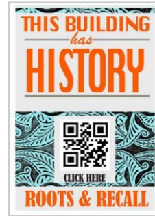
R&R HISTORY LINK: Springfield Plantation