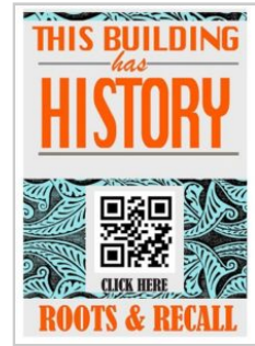
R&R HISTORY LINK: White Homestead