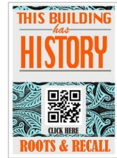
R&R HISTORY LINK: Occupational Link (Withers Connections)