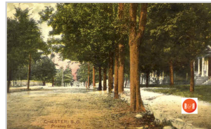
Early 19th century postcard image of prosperous Pinckney Street in downtown Chester, S.C.