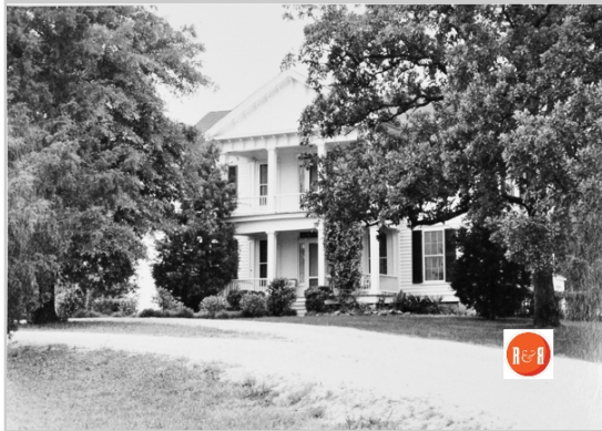
Walker – Withers Home