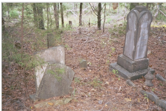
Berryman Withers cemetery plot in Fairfield County, S.C.